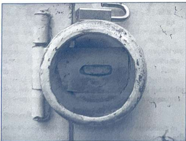
Shallow depth pipes do not prevent prying or lever action on locks.

Horizontally-mounted hoods that limit access to the lock, hasp and staple, and therefore prevent prying or lever action on the lock mechanism, meet the regulatory standard, provided that they are 1/4" steel and properly mounted to the magazine.