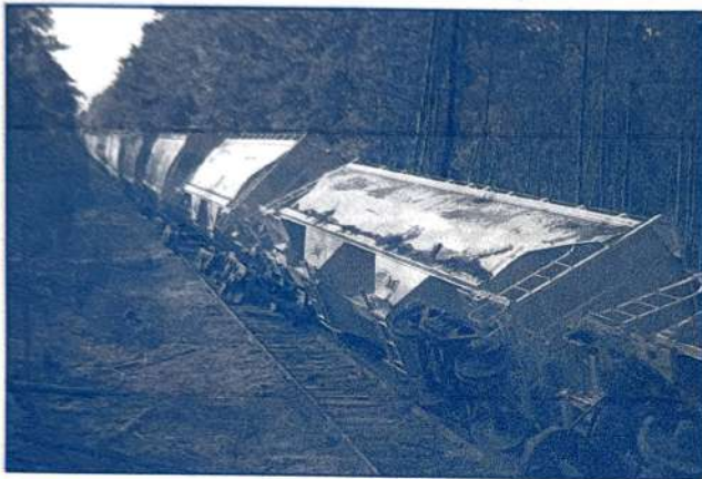
A nearby train is derailed after over 124,000 pounds of smokeless powder explodes in Minden, Louisiana.

Recently, ICE has been examining the safety management of explosives manufacturing facilities involved in decontamination, demilitarization or demolition of explosive materials. Such handling operations face significant risks as they frequently involve explosives, including fireworks, that may be of unknown origin and/or chemical compositions with unknown sensitivity or behavior. Damaged, altered or "dud" explosives and fireworks have an increased potential for inadvertent initiation and unknown sensitivity.